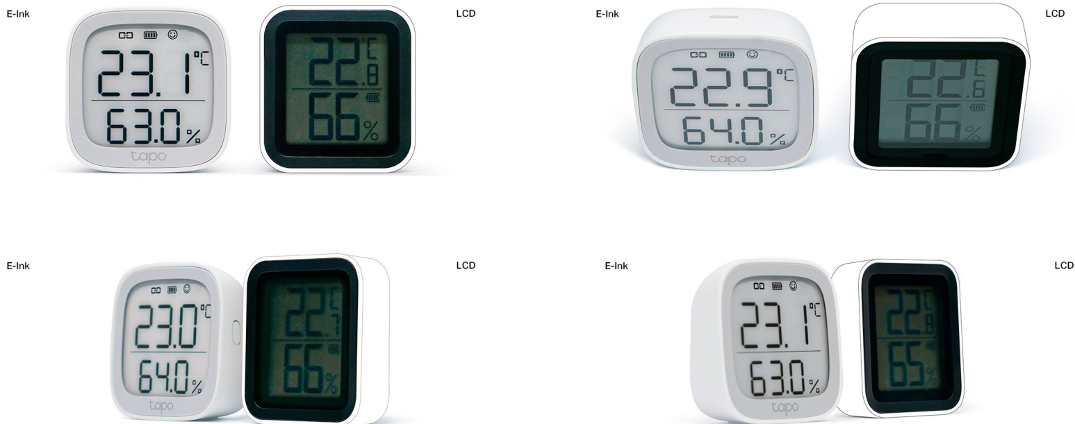
Comparison between an E-ink display and a backlit display.

Features a 2.7" E-ink display that reads like real paper. No screen glare and daylight readable with a 180 degree viewing angle.