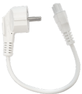
IEC C5 cord